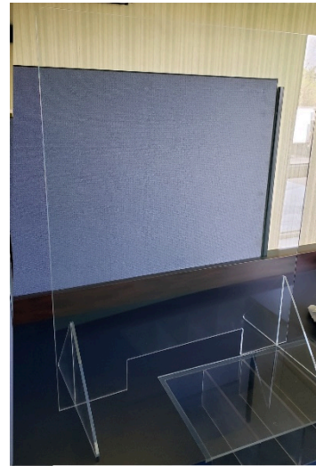
FGS-24X30 - FENCO GERM SHIELD - 1/4" ACRYLIC

Fenco VALUE BY DESIGN SINCE 1957 WWW.FENCOSANITARYEQUIPMENT.COM P.O. BOX 1238, 4432 RT. 130, BURLINGTON, NJ 08016 • 800-686-8484