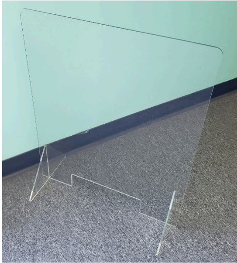
FGS-24X30 - FENCO GERM SHIELD - 1/4" ACRYLIC

Harry's Key Service is teaming up with manufacturers to provide Germ Shields. These Shields are freestanding clear acrylic shields that can be placed at any transaction area as a barrier for droplets from cough, sneeze, spitting or talking.